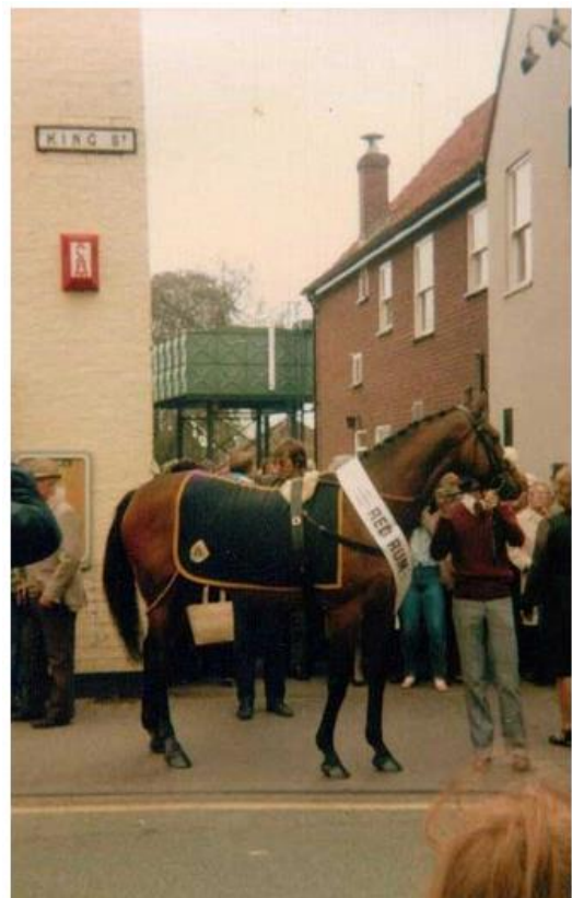
Famous racehorse Red Rum visits Market Rasen, May 1985

In the Paddock at Market Rasen Racecourse