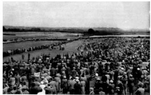
IN THE PADDOCK AT MARKET RASEN RACES